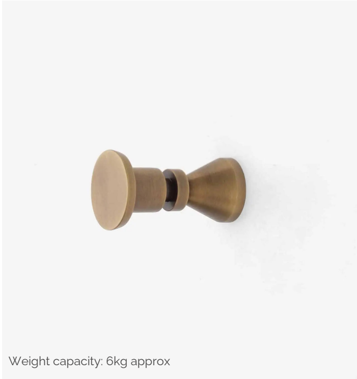
Weight capacity: 6kg approx