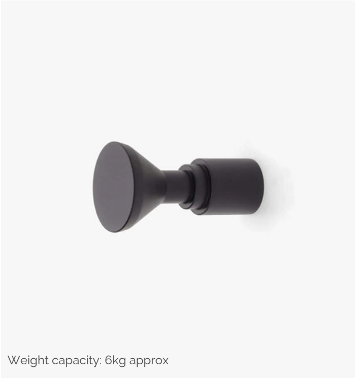
Weight capacity: 6kg approx