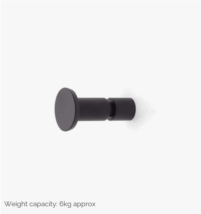
Weight capacity: 6kg approx